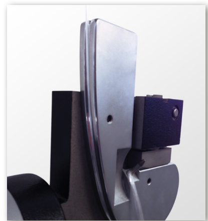
Grooved capstan aids in keeping multi-filaments bundled to provide more repeatable results