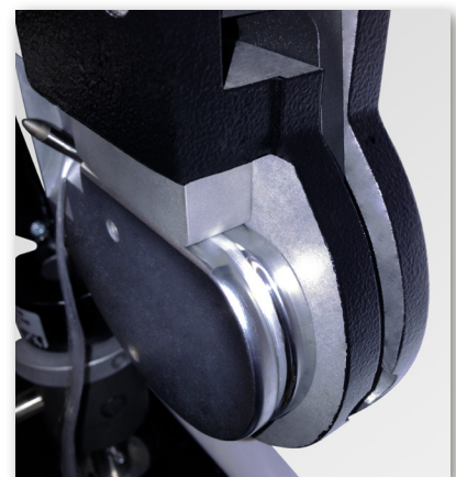
Close up of gripping transition to the grooved capstan