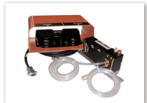
Automatic Air Control Kit for Pre-Tension Control